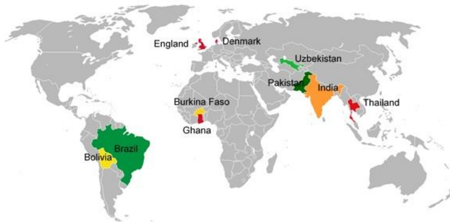
FIGURE 3. Distribution, topic, journal and publication year of the studies on water – ANT.