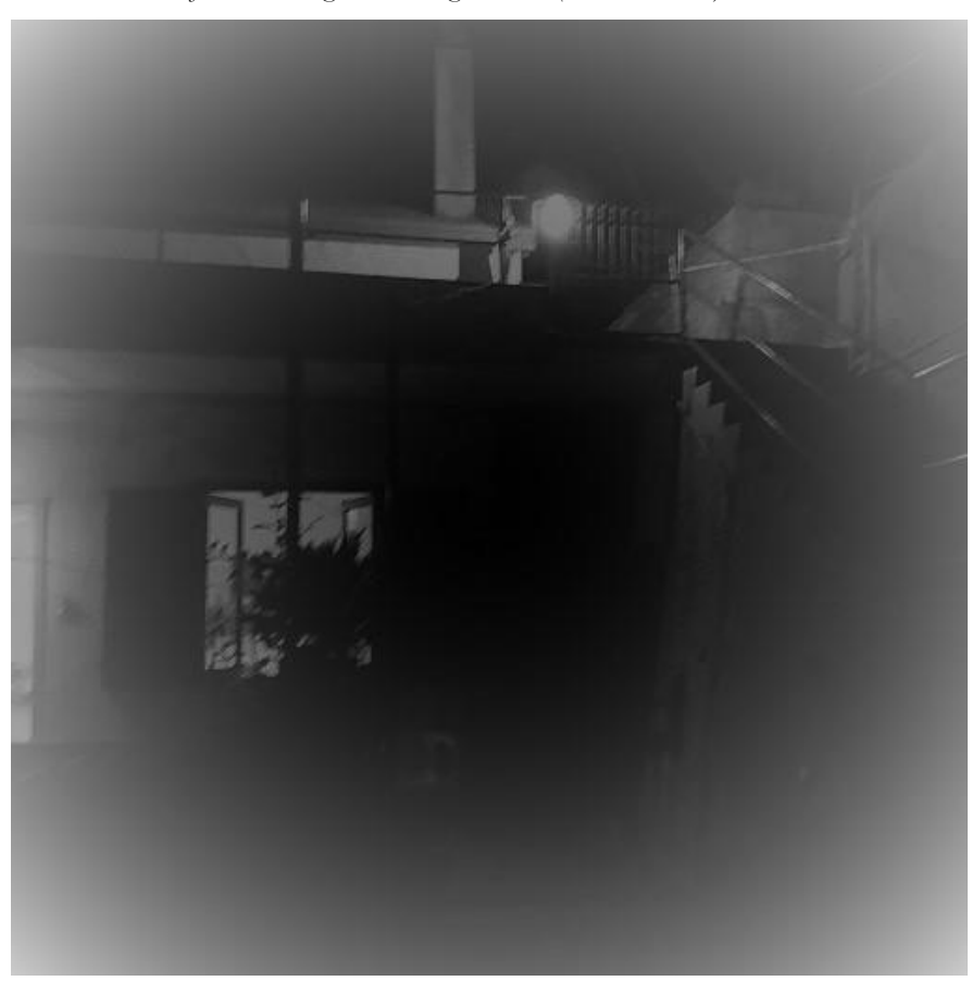
FIGURE 1. Adolfo Fattori, Ligottiana, August 2019 (Pollica, Salerno).

to acknowledge differences between "white" and "black" magic, between magia naturalis and witchcraft).<sup>4</sup>