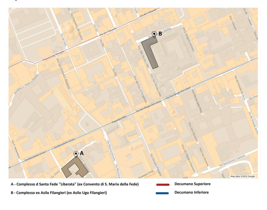
FIGURE 2. The geographical position of the two emerging commons in the historic center of Naples.

Often the 'inhabitants' interviewed referred to the historical importance of the building – once "all-female" and communitarian ante litteram – recalling in particular the phase from 1945 to 1980 when many families lived here after losing their homes during the second world war. These families shared the spaces of the Oratory (three floors and courtyard, including bathrooms and kitchens) and supported each other, organizing, among other things, a popular nursery called 'a scola d'o 'ntrattieno ("the entertaining school") or carrying out political actions (here the fight against the rise in the bread price started in 1973),